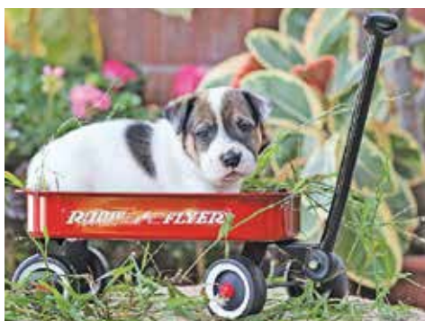
Spurs is a puppy who needs a family to love.

Saving one animal won't change the world, but the world will surely change for that animal. •