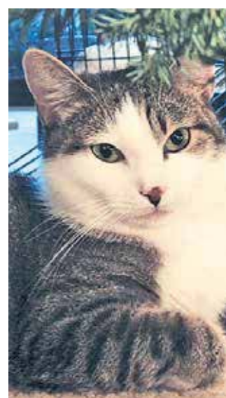
Arwen loves to be petted in a calm environment.

JellyBean is one very lucky kitten. He was discovered in a car engine, and his foster mom fished him out and cleaned him up. With his fluffy black coat, Jellybean is going out of his way to prove that black cats are lucky! And as if his handsome licorice coloring wasn't enough, he has developed hints of a white undercoat giving him a smoky appearance that is just too adorable for words. JellyBean absolutely loves other cats and even dogs. He is the perfect companion for a lonely cat as he is very high energy due to his youth. If you don't already have a kitty companion for him, Jellybean would love be adopted with Charleze, a gorgeous black female kitty who has adopted JellyBean as her baby or with fluffy grey kitten Constantine, who became his kitten companion upon his own rescue.