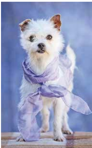
Lovey's favorite place is your lap.

Lovey is the sweetest dog ever! She was found as a stray in an empty lot with her two puppies; her owners were never located. Lovey is wonderful with all other dogs, loves all people and would like nothing better than to just hang out in your lap. She is very sweet, very smart and a very quick learner. With her cheerful personality, Lovey's tail is always wagging. She loves going for walks and is up for whatever outing you have planned. Lovey is spayed, current on vaccinations, microchipped, and fine with other dogs.