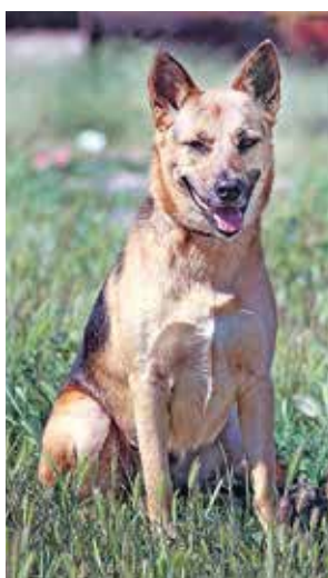
Jackie loves walks and family time.

Jackie is a beautiful 3 year old Shepherd/Lab mix. She was found as a stray and microchipped, but the people at the address she was registered to denied knowing her.