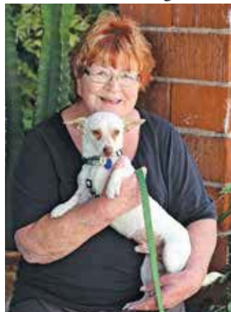
Radar is settling in and loves his new family and all the friends that he is meeting there!