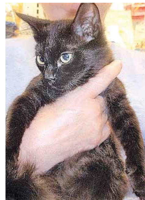
JellyBean is a great addition to a pet family.

Be kind. Save a life. Support animal rescue. •